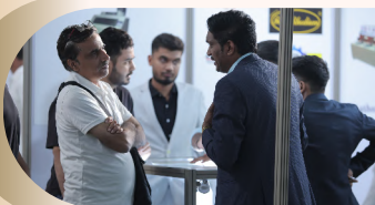
Our Hard Working Team Of SJMA