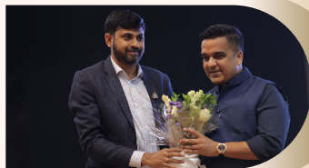
Hon'ble Cabinet Minister Shri Piyush Goyal