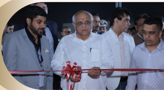
Hon'ble Chief Minister Of Gujarat Shri Bhupendrabhai Patel