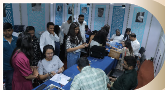
Our Enthusiastic Visitors