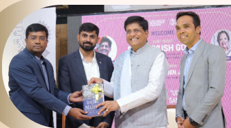
Our Precious Exhibitors